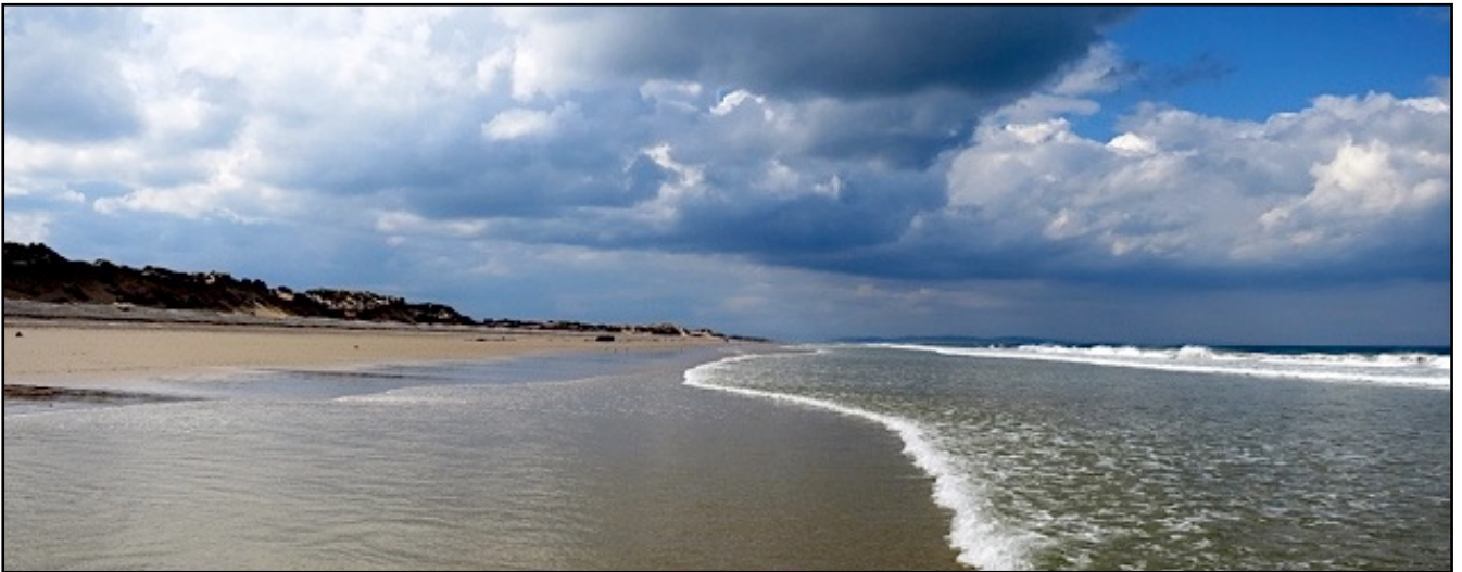
The beach at Findhorn

With so much love and joy Barbara Swetina